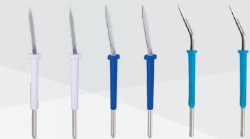
A804, A805, A806, A807, A806DE, A807DE