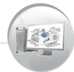
HL7 protocol connect to hospital system