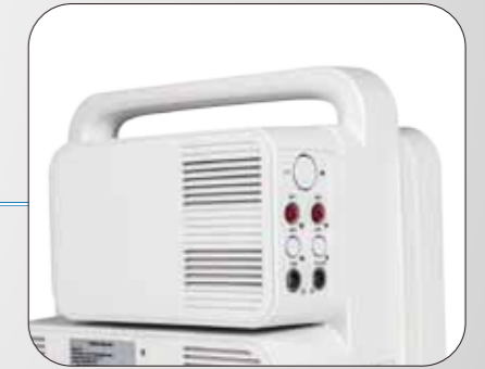
Parameter case for optional parameters