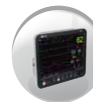
Bed to bed view via central monitor station