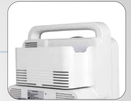
Accessory box for standard configuration